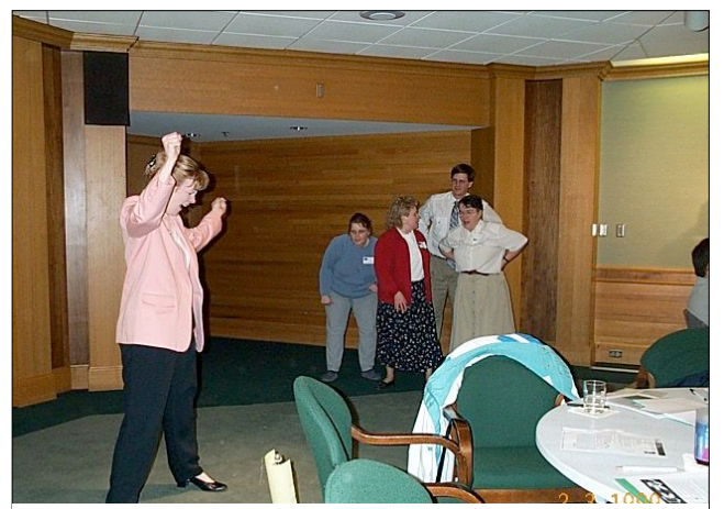
Middle school educators in Muncie, Indiana conduct a weightlessness lesson during a workshop in April 2000.

Master Teacher Workshop : for the master science teachers on the Local Team. Held in advance of the educator workshop(s), it is required only if attendance at an individual educator workshop exceeds 60.