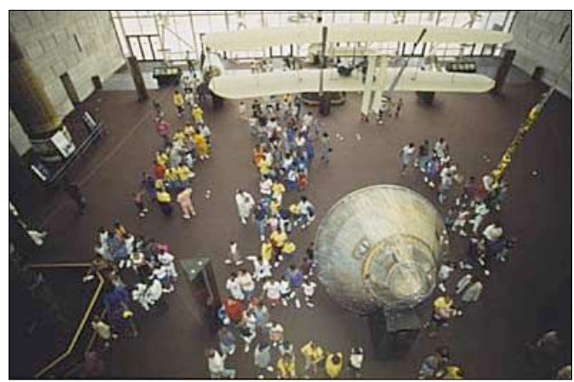
Family event at the Smithsonian's National Air and Space Museum, as part of Journey through the Universe in Washington, DC.

Family and Public Science Events: one to three daytime or evening events at local science centers and auditoria. Each event includes an interactive presentation—more accurately described as a performance—by a Visiting Researcher, and is appropriate for family learning, is curriculum-relevant, and typically attended by 100-1,000. Events are advertised in the community at individual schools as a school function, and as a public event in the media.